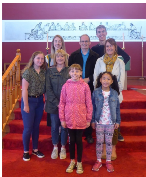
The team now