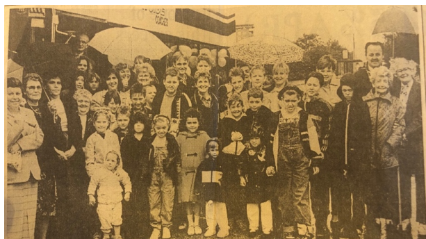
Parish Outing, organised by St Vincent de Paul Society, to Crombie Park, 1990