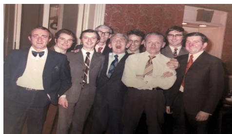
9 of the original St Ninian's St. Vincent de Paul group.